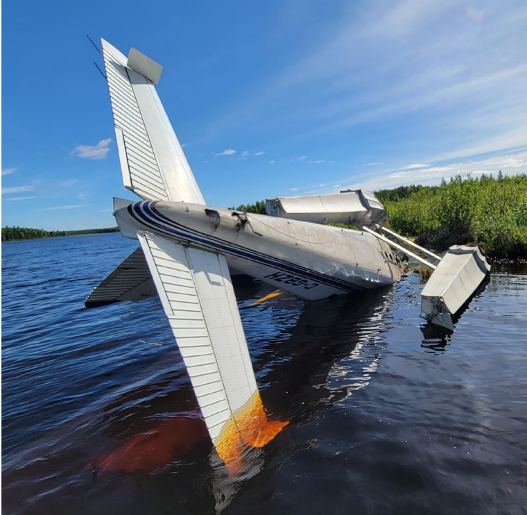
Figure 2. The occurrence aircraft following impact with terrain

The aircraft was substantially damaged. There was no post-impact fire. The emergency locator transmitter activated.