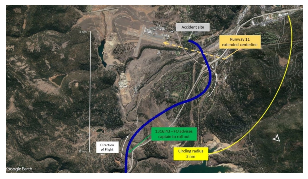
Figure 2. The airplane's downwind leg and allowed circling radius.

At 1316:20, the FO deployed full flaps (45°) after confirming with the captain. A second later (near YAKYU waypoint), the FO said, "There's the airport," told the captain to make a 90° right turn, and contacted Truckee tower, which cleared the airplane to land. The FO attempted to point out the airport to the captain, and the captain asked "where?" twice. At 1316:43, the FO told the captain to roll out (level the wings, stopping the turn) and turn the autopilot off. The airplane was at the beginning of the downwind leg turn (about 213° magnetic) when the FO told the captain to roll out, and the airplane rolled out on a heading of about 233°. Figure 2 depicts the turns taken by the airplane in the approach and the maximum circling radius of 3 nm allowed for category C aircraft at TRK in the airport's approach charts (the airplane was at least 1.3 nm from that maximum circling radius).