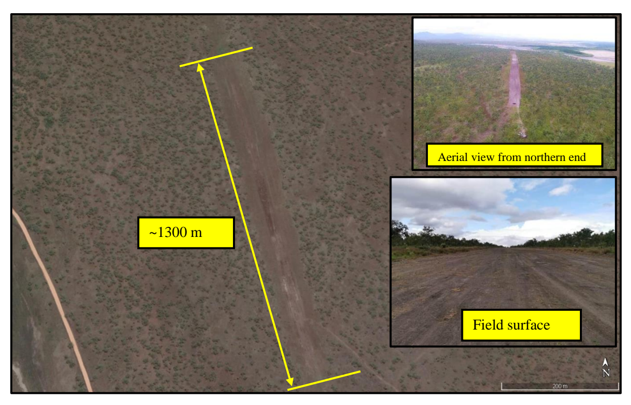
Figure 3: Uncommissioned field used for the operation of the aircraft.