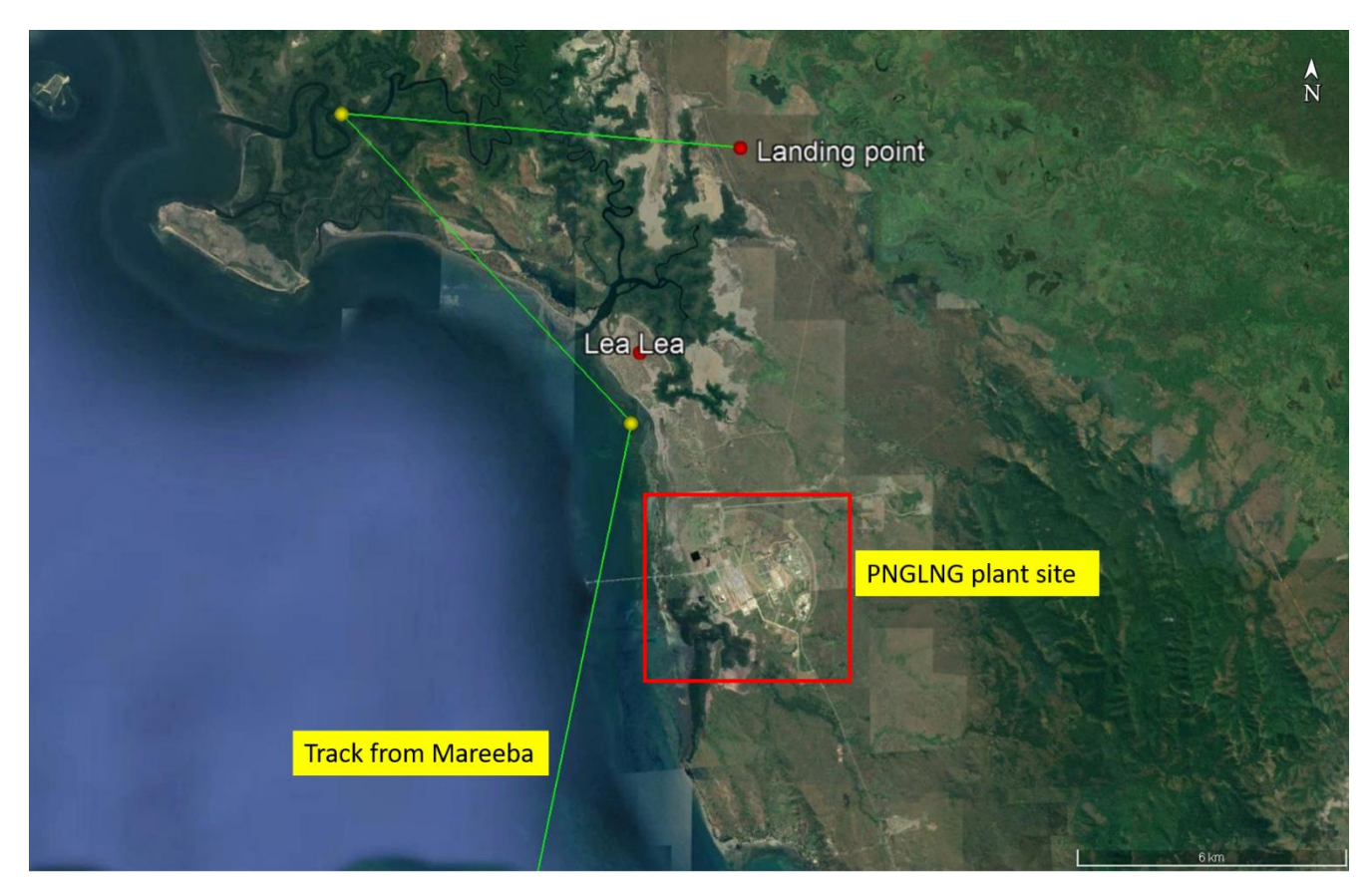
Figure 2: VH-TSI final part of the track into Papua New Guinea (as described by the pilot).

After shutting down the aircraft, the aircraft was refuelled with jerrycans full of fuel (AvGas) and loaded with cargo by persons waiting on the ground. The pilot reported that he estimated that a distance of 800 m would be required for the take-off.