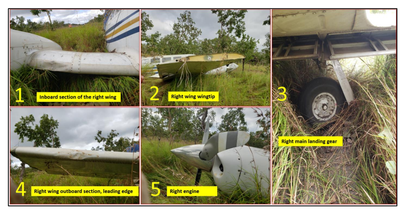
Figure 5: Damage on the right wing