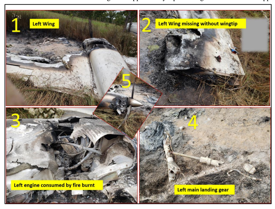
Figure 4: Damage to left wing

The outboard section of the left wing was clipped off by a protruding tree as the aircraft approached to land.