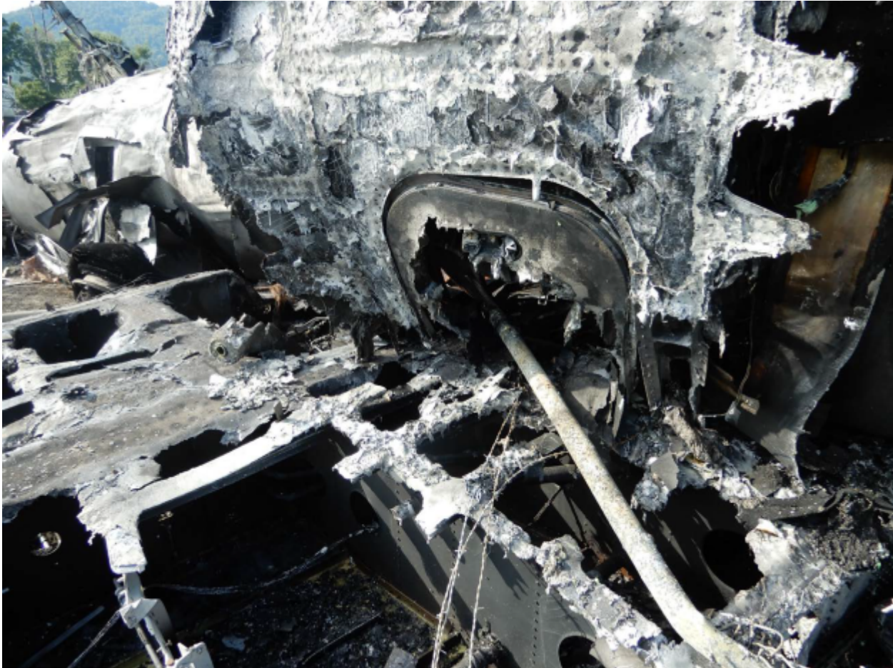
Figure 3: Emergency escape hatch impaled by a metal fence post.