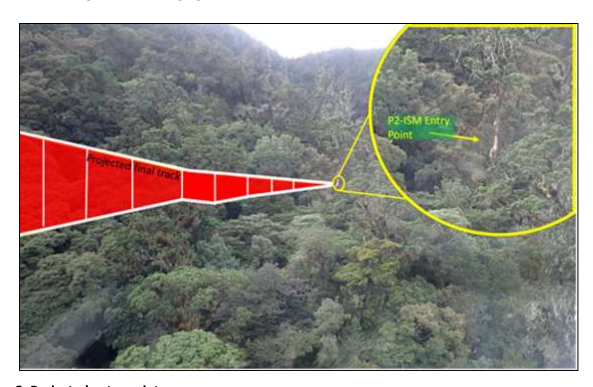
Figure 3: Projected entry point