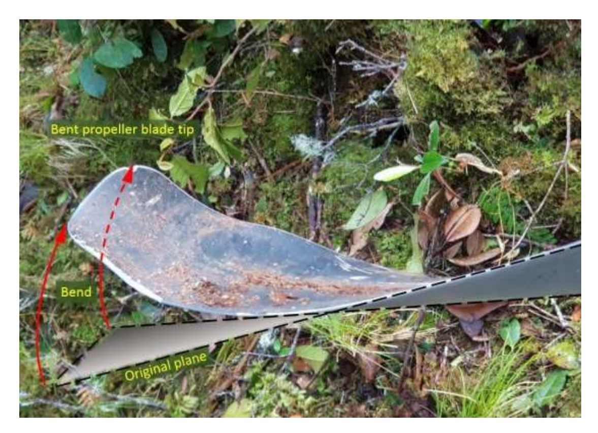
Figure 8: Propeller tip bending