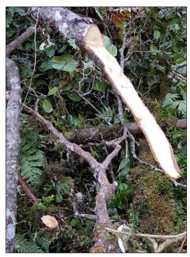
Figure 9: Tree branch showing definitive propeller slash

The investigators who travelled to the accident site made use of a drone to capture evidence in video and photographic form. Close-up pictures and video of damage to the trees, including propeller slash marks, was made easy by use of the drone.