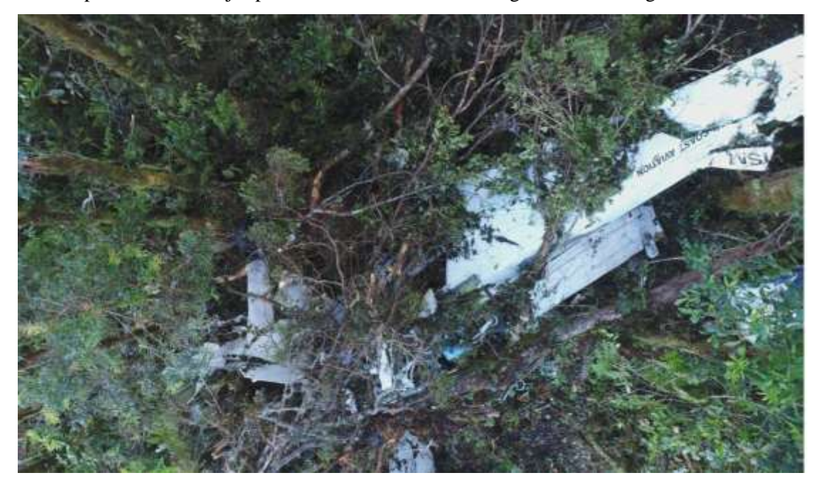
Figure 7: P2-ISM wreckage (overhead view)

It is likely that the aircraft flew another 130 metres unobstructed (about 3 to 4 seconds) before it impacted another tree and rapidly descended at a steep nose-down attitude, between 55 and 60 degrees, through the forest canopy and impacted the ground. The forest canopy for the most part closed over after the aircraft went through it. Few signs of entry were left, and it was almost impossible to sight the wreckage from the air. The majority of the wreckage was confined to the main impact area. All major parts were accounted for during the site investigation.