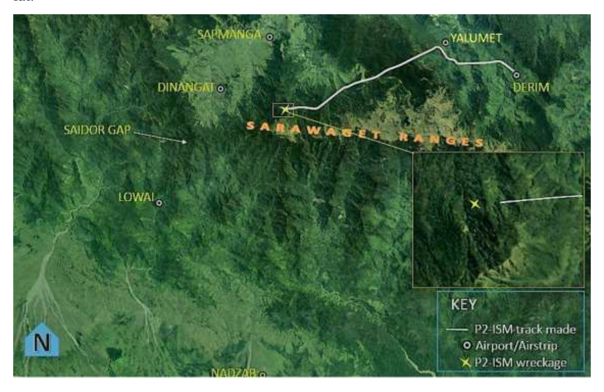
Figure 1: Aircraft track and wreckage location

On 23 December 2017, at 00:10 UTC¹ (10:10 local), a Britten Norman BN-2A Islander aircraft, registered P2-ISM (ISM), owned and operated by North Coast Aviation, impacted a ridge, at about 9,500 ft (6°11'29"S, 146°46'11"E) that runs down towards the Sapmanga Valley from the Sarawaget Ranges, Morobe Province. The pilot elected to track across the Sarawaget ranges (See figure 1), from Derim Airstrip to Nadzab Airport, Morobe Province, not above 10,000 ft. The track flown from Derim was to the northwest 6.5 nm (12 km) to a point 0.8 nm (1.5 km) west-southwest of Yalumet Airstrip where the aircraft turned southwest to track to the Saidor Gap. GPS² recorded track data³ immediately prior to the last GPS fix showed that the aircraft was on a shallow descent towards the ridge. The aircraft impacted the ridge about 150 m beyond the last fix.