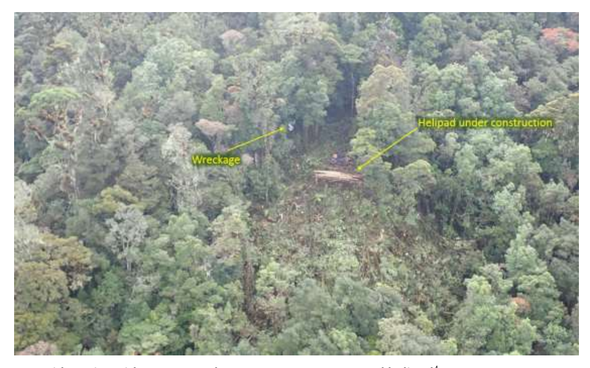
Figure 5: Accident site with respect to the rescue team constructed helipad<sup>4</sup>