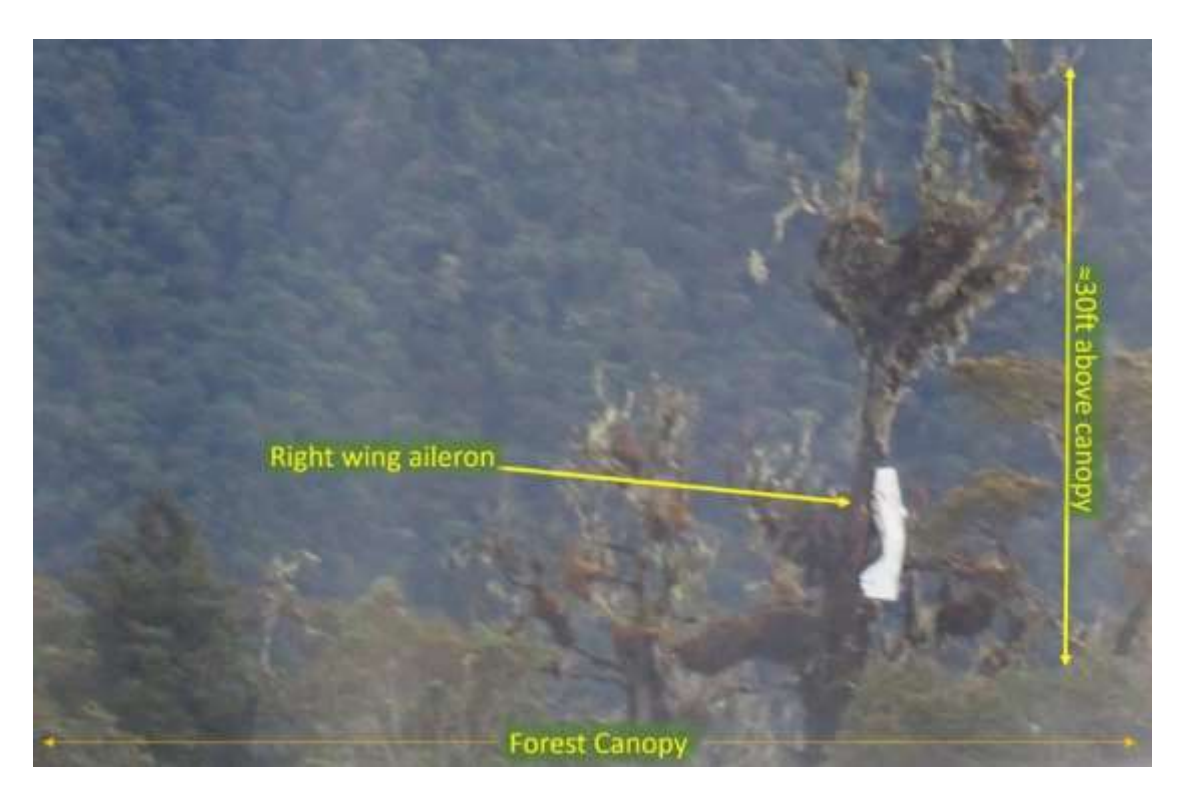
Figure 2: P2-ISM right aileron hanging from a tree.