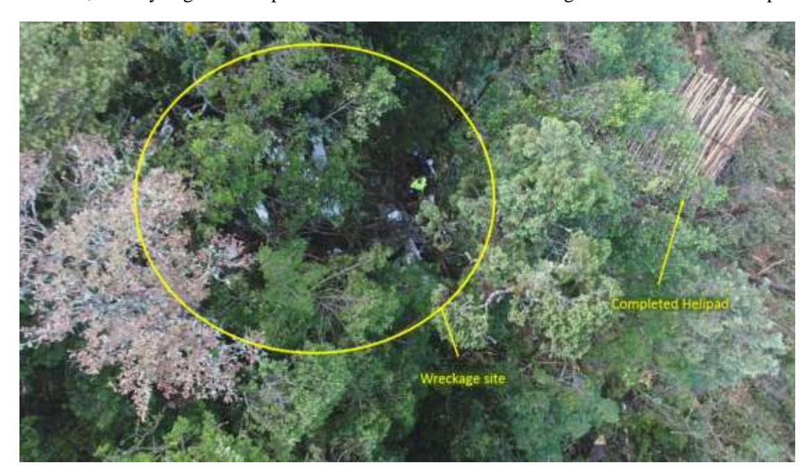
Figure 4: Accident site through the canopy (overhead)

The majority of the aircraft wreckage was contained at the ground impact point. The aircraft was destroyed by impact forces. The pilot, the sole occupant, who initially survived, was reported deceased by the rescue team on 27 December 2017 at 22:10. The pilot had made contact with one of the operator's pilots at 16:15 on 23 December. The pilot's time of death, recorded on the Death Certificate, was 10:40 am local on 24 December. Rescuers felled trees on the steep heavily timbered, densely vegetated slope about 20 metres from the wreckage and constructed a helipad.