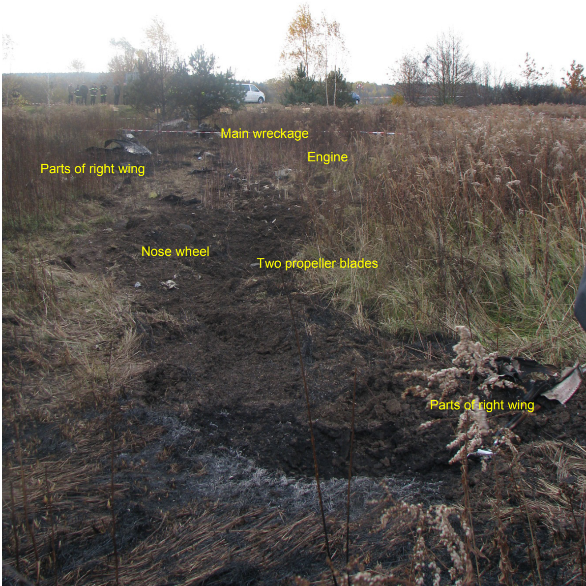
Initial ground contact in viewing direction towards the main wreckage