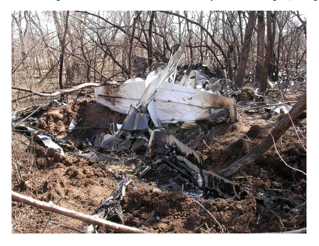
Figure 3. Horizontal stabilizers and elevators with fire-damaged wreckage below.

Examination of the airplane's horizontal stabilizer at the accident site revealed that it was oriented leading-edge down on top of a ground crater that contained fire-damaged wreckage debris. Dark brown to black soot patterns on the left and right horizontal stabilizers and elevators corresponded to the location of fire-damaged wreckage in the crater below. Soot patterns that extended into crush-damage folds on the trailing edge of the left elevator skin corresponded to an area where a damaged tree or tree limb came to rest on top of the wreckage. (See figure 3.)