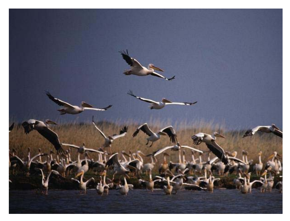
Figure 2. American white pelicans.

114 in.<sup>32</sup> (See figure 2.) The examination of a preserved American white pelican at the Smithsonian Institution's ornithology collection showed that the bird's body could be about 30 in long with a 12- to 15-in diameter.