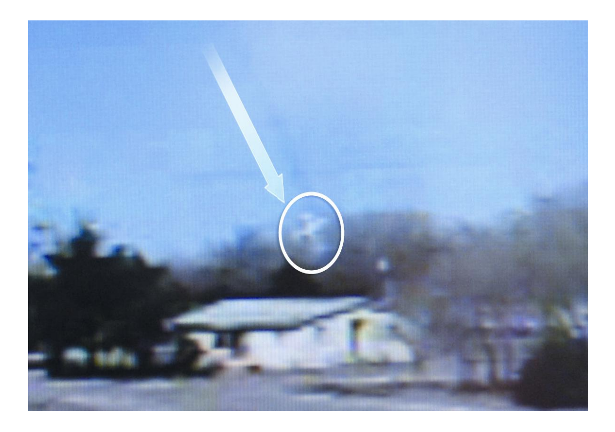
Figure 1. Screen capture of a video image showing the accident airplane (circled) and the visible trail behind it (to the right of and approximately parallel to the arrow) before ground impact.

A security camera located about 1/2 mile southwest of the accident site captured images of the accident airplane descending steeply, nose down to the ground while emitting a visible trail. (See figure 1.) The video also showed that a large fireball followed the airplane's impact.