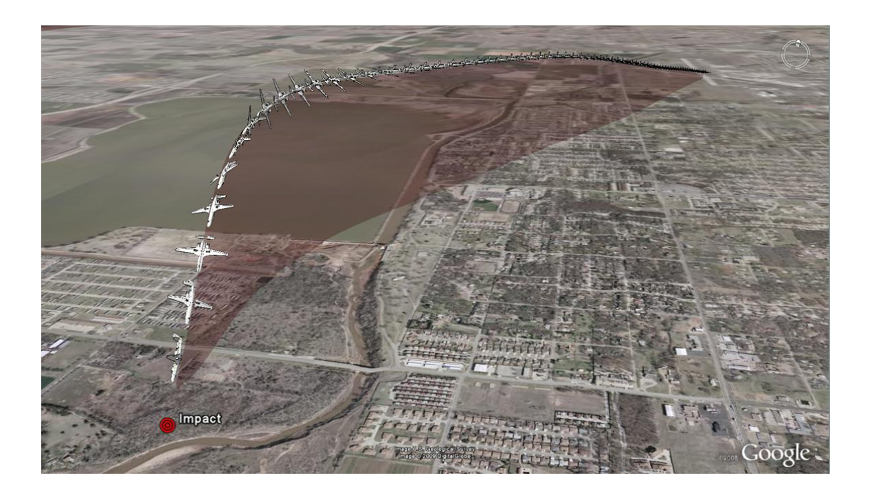
Figure 5. Simulation-based illustration of the airplane's descent and left roll through the inverted position.