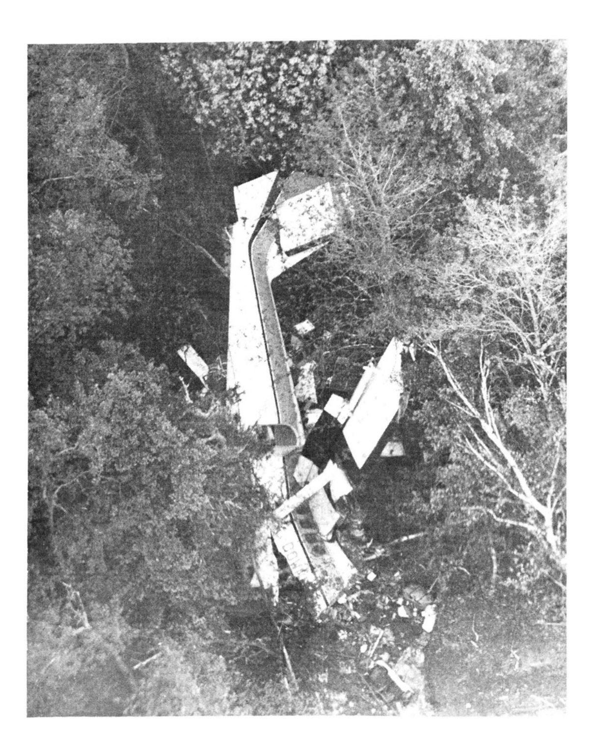
Figure 2.-Aerial view of accident aircraft.