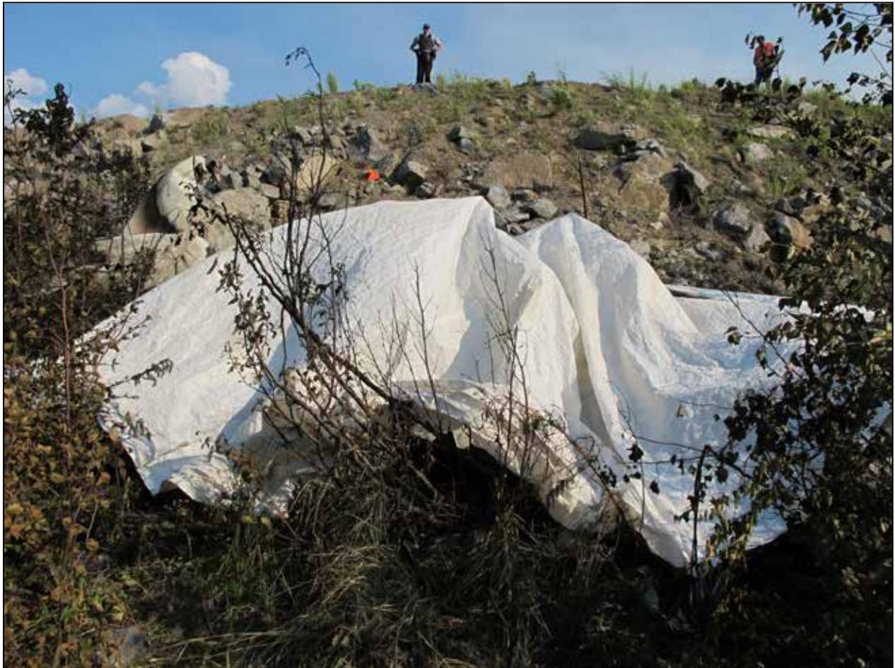
Photo 1. Accident site, looking back at the end of Runway 33 (Pukatawagan Airport)

post-crash fire ensued almost immediately and consumed most of the aircraft. One of the passengers injured in the accident died because of smoke inhalation due to the post-crash fire.