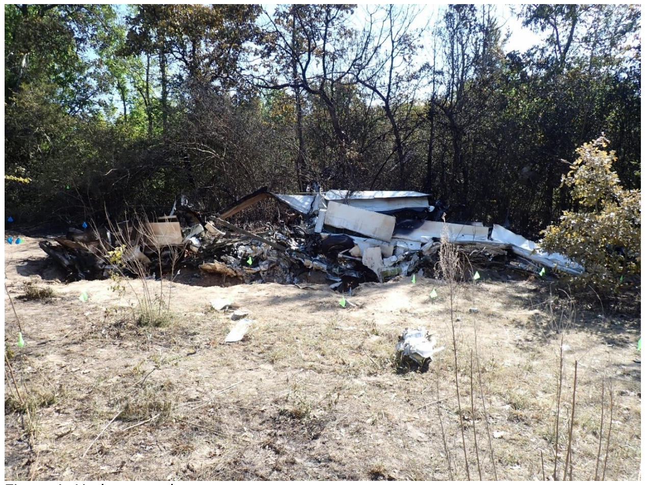
Figure 4. Airplane wreckage.

Both the left and right engine nacelles were separated from the wings, and the engine and propeller assemblies were embedded in 3-ft-deep craters forward of the main airplane wreckage. The engines sustained heavy impact damage, and the propellers were fractured and separated at their crankshafts immediately aft of the flanges. All three blades on the left and right propellers were bent aft and showed leading-edge polishing and chordwise rubs and scratches.