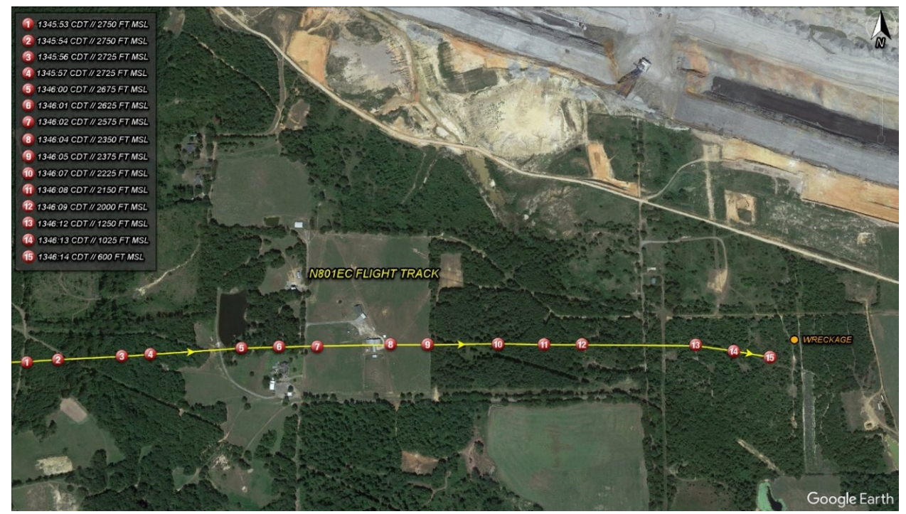
Figure 3. Flight track with final data points.

A local resident about 1 mile from the accident site reported that, while inside his residence, he heard and felt a "boom" that shook the windows. His wife then saw black smoke rising immediately.