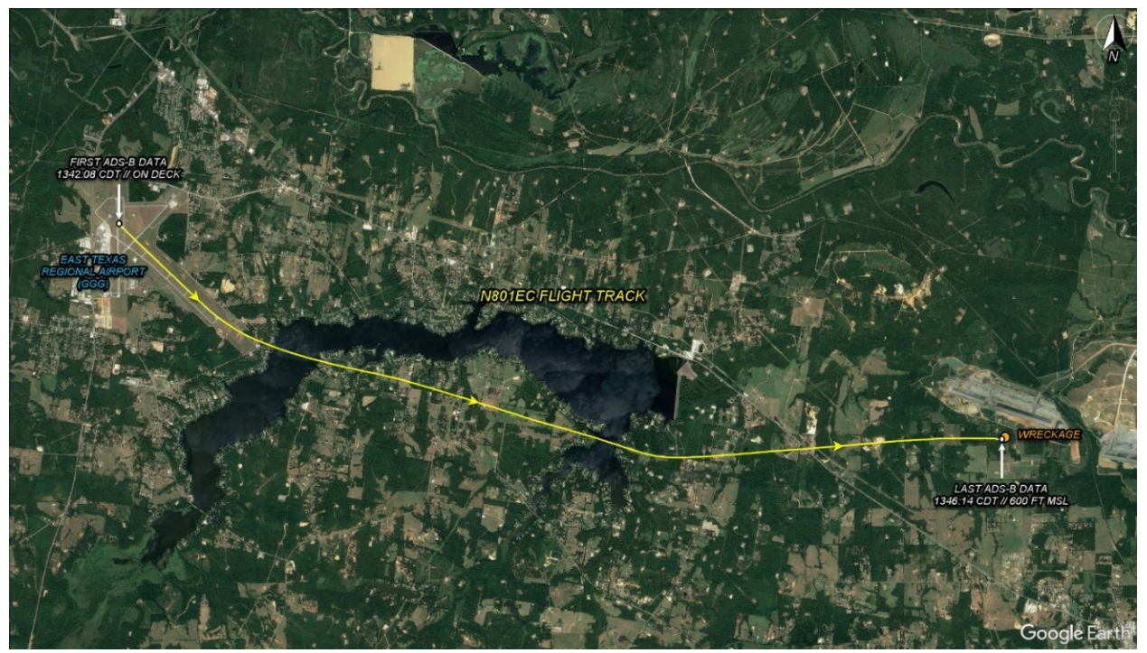
Figure 1. Airplane flightpath.