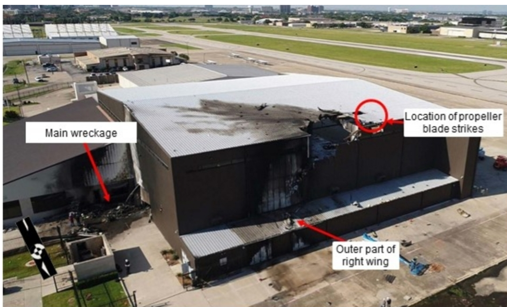
Figure 2. Photograph of an aerial view of the accident site

Propeller blade strikes (see figures 2 and 3) were observed at the airplane's initial point of impact including a strike to a hangar roof truss, which was coated white. Evidence indicates that the strikes were made by the left propeller. The distances between the propeller blade strikes were measured to determine propeller speed at impact (see figure 3). The left propeller's speed at impact was estimated at 1,259 to 1,300 rpm.