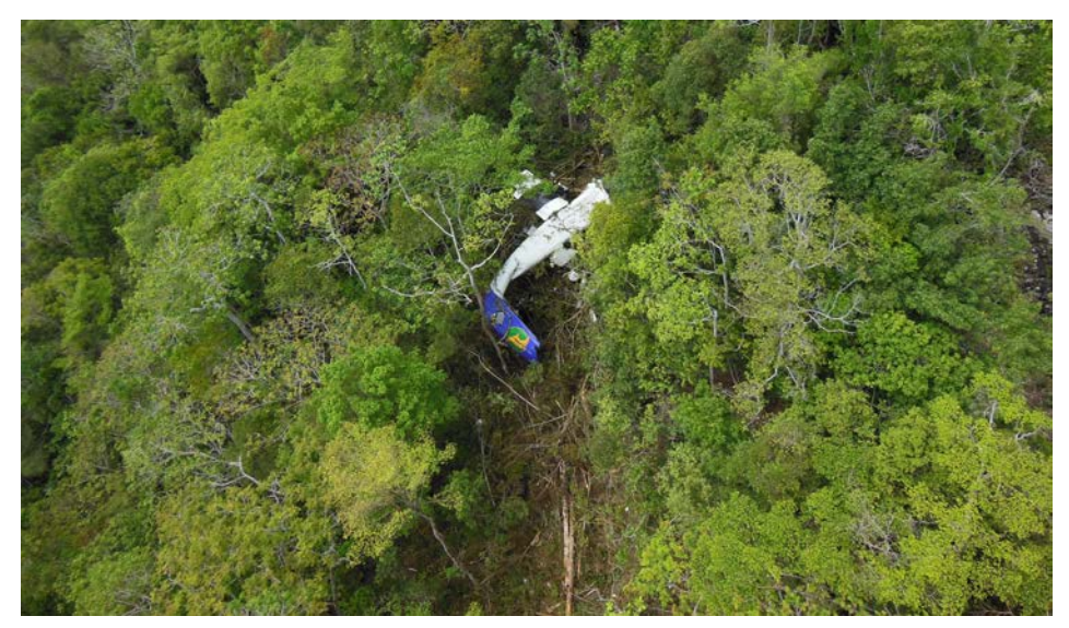
Figure 6: Wreckage of KSF and impact trail