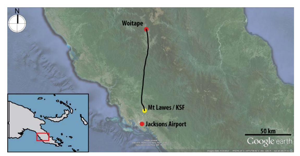
Figure 1: Track of KSF from Woitape to Mt Lawes

KSF departed Woitape for Port Moresby at 2316 with seven passengers and the two pilots on board. The copilot was the handling pilot and the pilot in command (PIC) was the support monitoring pilot responding to radio calls and communicating with Air Traffic Control.