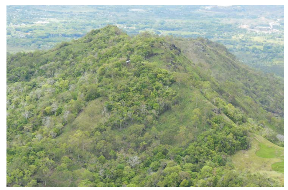
Figure 4: KSF accident site on Mt Lawes