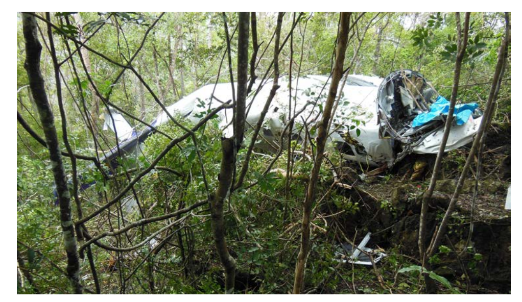
Figure 7: Wreckage of KSF

The right wing separated from the fuselage and was found inverted on the right side of the aircraft. The right engine was situated on the ground beneath the main wreckage (the rear part of the main wreckage remained elevated, see Figure 8).