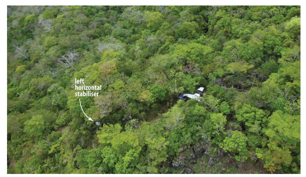
Figure 5: Wreckage of KSF and impact trail

The impact sequence left a trail approximately 100 m long in the vegetation.