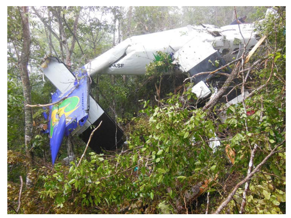
Figure 8: Wreckage of KSF showing empennage hanging